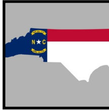
New! NCDHHS Injury and Violence Prevention Branch Data Product