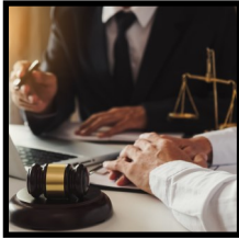
North Carolina Legislative Update